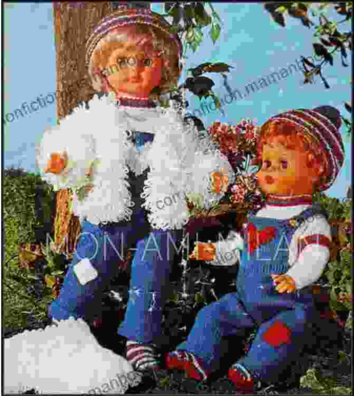
Dolly's Loopy Jacket adorning a beloved doll, bringing warmth and charm to its playtime adventures.