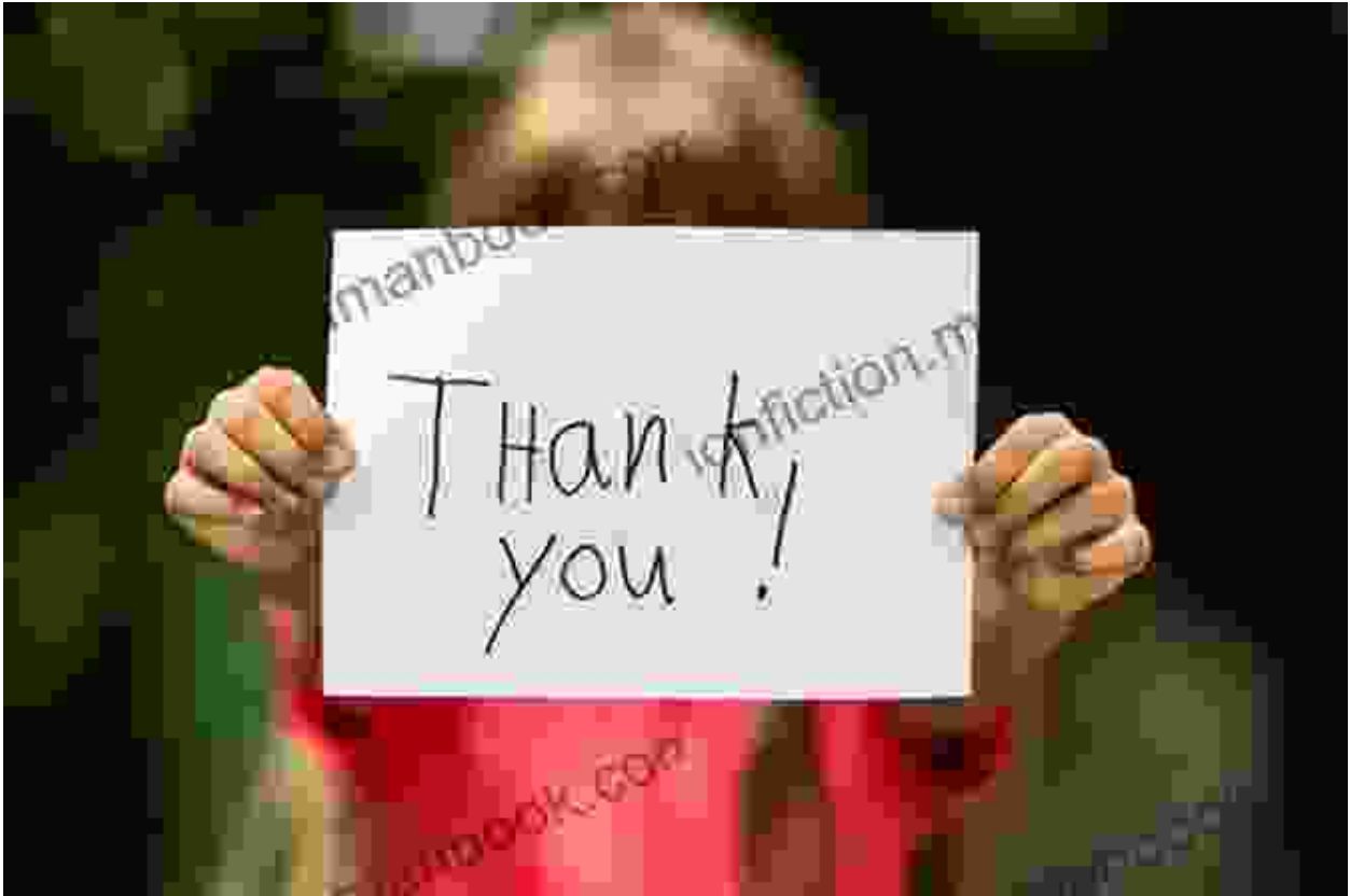
Merci (Thank you)