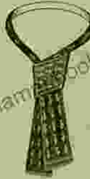
No. 6—Gentlemen's Striped Necktie, with outside band of silk, price 25c.