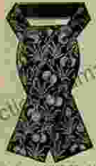
No. 4—Gentlemen's Striped Necktie, in all the new designs and colors, with outside band of silk, price 25c.