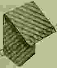
No. 1—Gentlemen's Striped Necktie, with outside band of silk, price 25c.