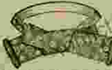
No. 8—Gentlemen's Striped Necktie, with outside band of silk, price 25c.