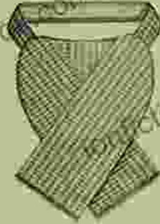
No. 2—Gentlemen's Cravat, Fine Striped, in all the new colors and designs, including, price 25c.