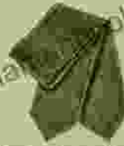
No. 3—Gentlemen's Striped Necktie, with outside band of silk, price 25c.