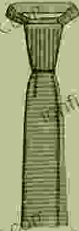
No. 5—Gentlemen's Striped Necktie, with outside band of silk, price 25c.