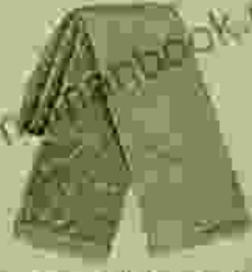
No. 9—Gentlemen's Striped Necktie, with outside band of silk, price 25c.

This vintage men's tie adds a touch of sophistication to any outfit.