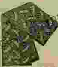
No. 7—Gentlemen's Striped Necktie, with outside band of silk, price 25c.